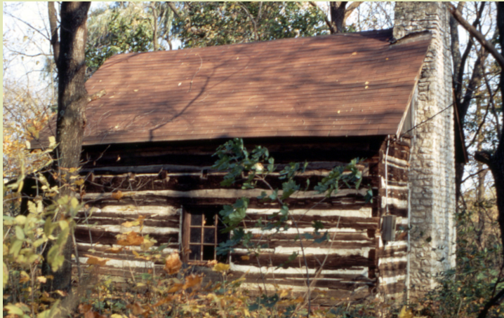
Ludwick Sells log house in 1982.

(Story Credits: WOSU Public Media, NBC4 WCMH TV, Columbus Dispatch)