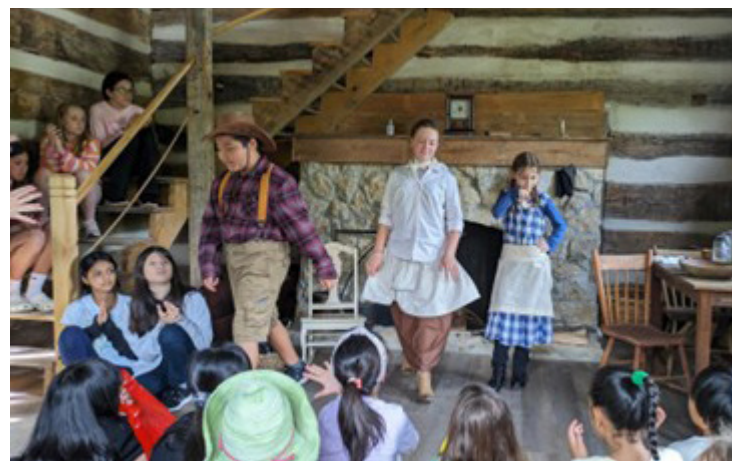
Clockwise from top right: A student tries his hand at weaving. An "after photo" of students performing a play in the cabin with new cabin fireplace and flooring. View of Davis Cabin.